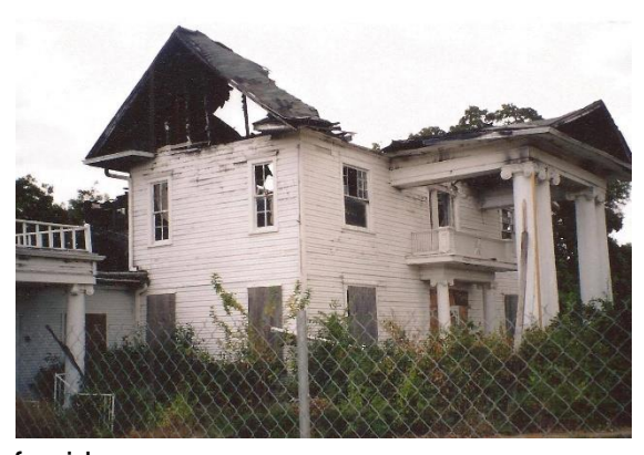
Officials questioned a suspect, but there was a lack of evidence, as often is the case with arson.

A few hours after midnight on Halloween 1998, the historic J. D. Cooper home caught fire. Believed to be a teenage prank that quickly escalated, flames soon engulfed the large, wooden structure. Dozens of firefighters battled the blaze in the darkness. Ultimately, the fire destroyed the roof and charred the second floor, causing smoke and water damage to the interior and many of its antique furnishings.